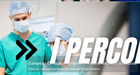
European College of Veterinary Anaesthesia and Analgesia Advancing veterinary anaesthesia and analgesia through excellence.