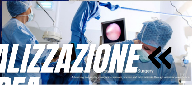
European College of Veterinary Surgery Advancing surgery for companion animals, horses and farm animals through veterinary excellence.