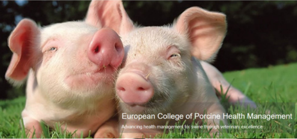
European College of Porcine Health Management Advancing health management for swine through veterinary excellence.

EBVS EUROPEAN BOARD OF VETERINARY SPECIALISATION